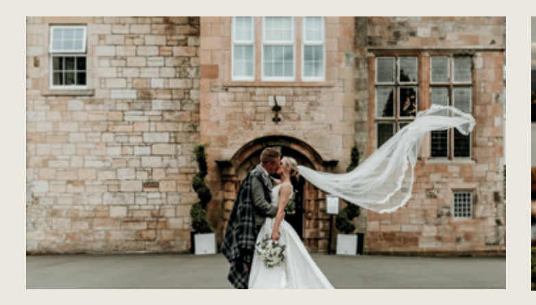
DALMENY PARK GLASGOW

The Radstone Hotel is tucked away in rural Lanarkshire. Set in its own extensive grounds with striking scenery and landscaped gardens.