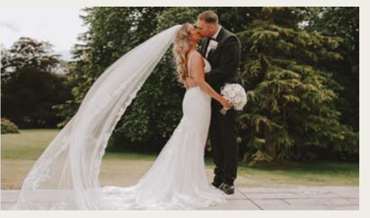
HETLAND HALL DUMFRIES

The Multi-Award Winning, Lochside House Hotel & Spa, is a hidden Scottish gem, set in the tranquility of the picturesque Ayrshire countryside.