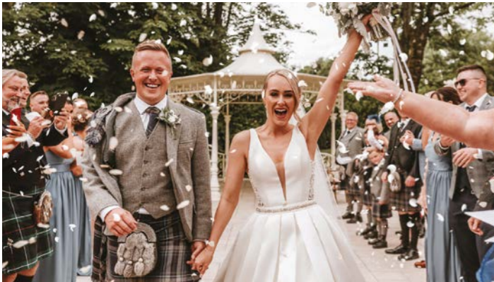
DALMENY PARK GLASGOW

Brig o' Doon is an iconic venue set amidst several acres of perfectly manicured gardens and grounds. Located in the heart of historic Ayrshire it is one of Scotland's most well-known wedding venues.