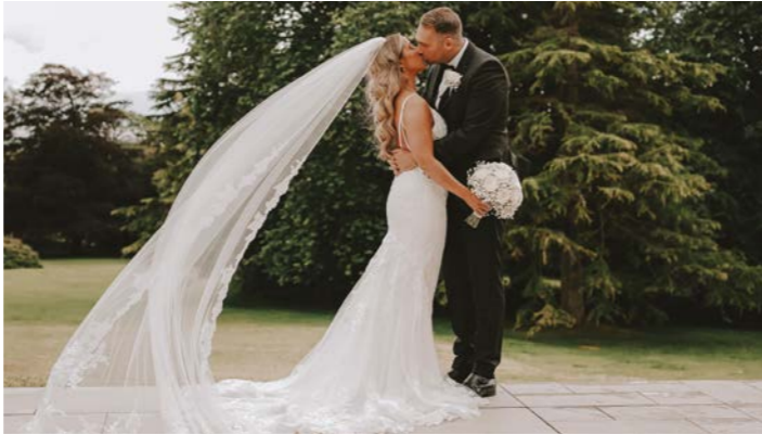
HETLAND HALL DUMFRIES

The Multi-Award Winning, Lochside House Hotel & Spa, is a hidden Scottish gem, set in the tranquility of the picturesque Ayrshire countryside.