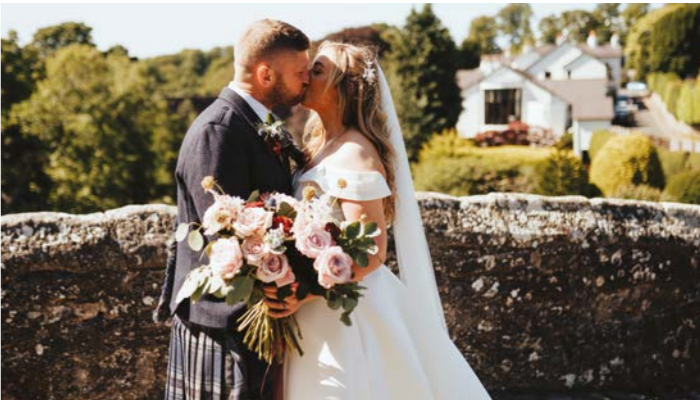
BRIG O' DOON ALLOWAY

Centrally located for easy access to Ayr & Prestwick. The Carlton Hotel Prestwick boasts beautiful landscaped gardens providing a picturesque backdrop for your wedding.