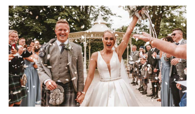
DALMENY PARK GLASGOW

Brig o' Doon is an iconic venue set amidst several acres of perfectly manicured gardens and grounds. Located in the heart of historic Ayrshire it is one of Scotland's most well-known wedding venues.