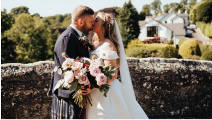
BRIG O' DOON ALLOWAY

Hetland Hall Hotel is an elegant country house set amidst picturesque gardens and grounds. The romantic ceremony suite offers sweeping views of the Solway Firth with stylish interiors, we can think of no better setting.