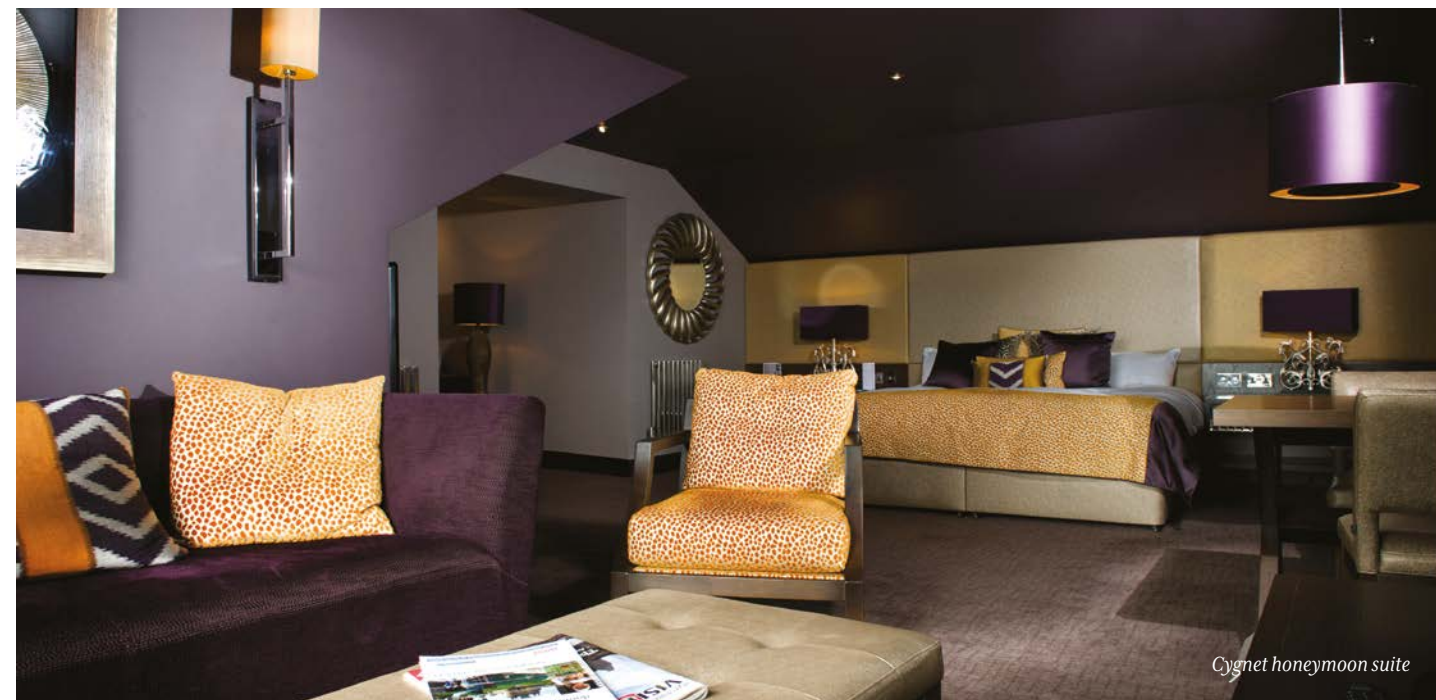
Cygnet honeymoon suite

Upgrade to our Cygnet honeymoon suite, overlooking the Loch of Lowes and Afton hills, the perfect ending to the most magical day of your life.