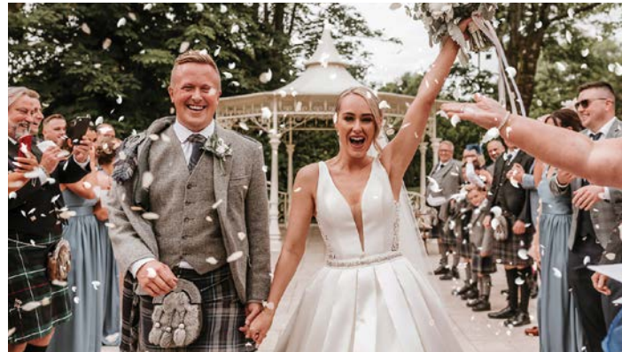
DALMENY PARK GLASGOW

Brig o' Doon is an iconic venue set amidst several acres of perfectly manicured gardens and grounds. Located in the heart of historic Ayrshire it is one of Scotland's most well-known wedding venues.