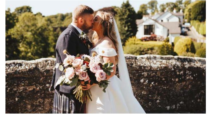
BRIG O' DOON ALLOWAY

Centrally located for easy access to Ayr & Prestwick. The Carlton Hotel Prestwick boasts beautiful landscaped gardens providing a picturesque backdrop for your wedding.