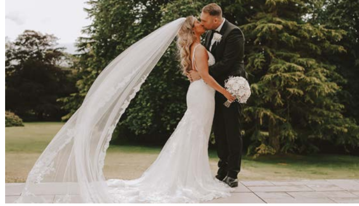
HETLAND HALL DUMFRIES

The Radstone Hotel is tucked away in rural Lanarkshire. Set in its own extensive grounds with striking scenery and landscaped gardens.